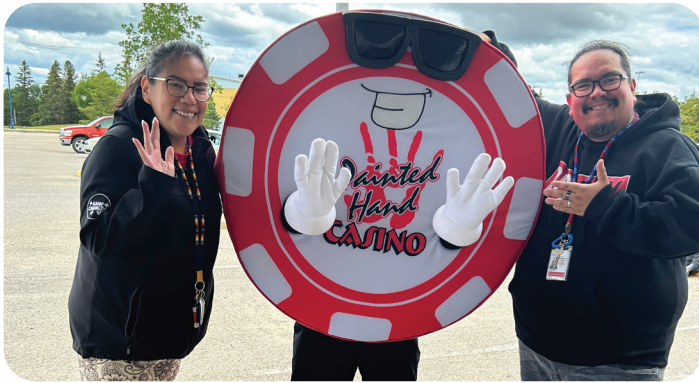
[Painted Hand Casino volunteers pose for a pic at the PHC Community BBQ.]