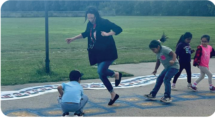
[Bear Claw Casino & Hotel volunteers help out at the White Bear Education Complex for SIGA Day of Sharing.]