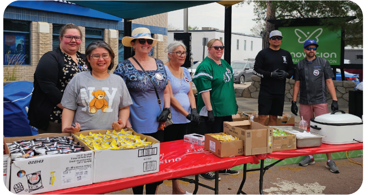
[Volunteers at Living Sky Casino's Community BBQ.]