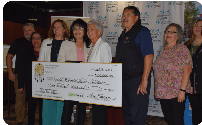
(A $100K cheque is presented to Ronald McDonald House by NLC for the Miles to Go Campaign.)

The SIGA RG Team continues to promote Responsible Gaming to our players and staff through regular site visits. During these visits, the team reviews RG collaterals, connects with players and our employees through educational activities (Player Events) and maintaining RG Check accreditation standards.