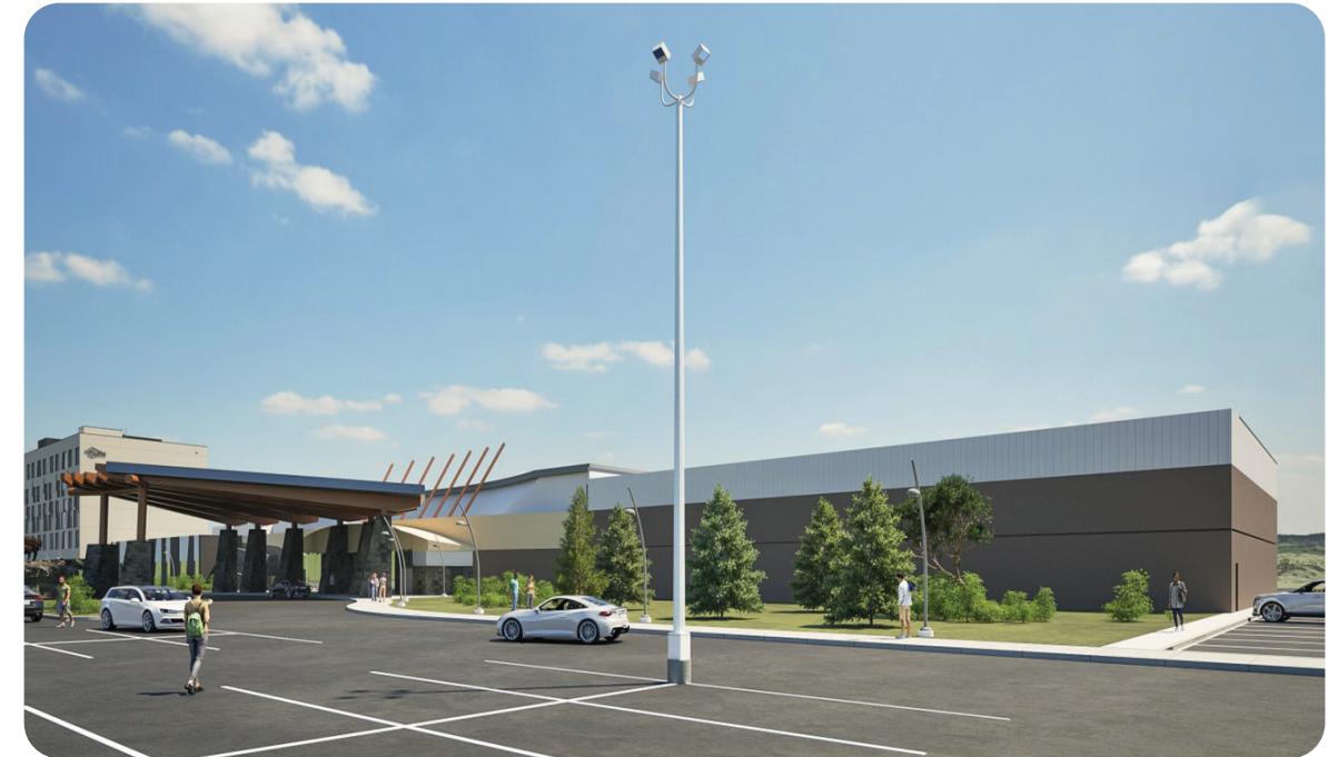
(The 12,000 square foot expansion at Dakota Dunes Casino will include more space on the gaming floor, new food and beverage spaces and a new high limit table game area. It was announced in October, 2024. A rendering of the expected finished product is provided by aodbt.)

The Saskatchewan Indian Gaming Authority unveiled plans for an expansion to its existing Dakota Dunes Casino property on October 18, 2024. The expansion is adding 12,000 square feet to gaming floor footage, with plans to also build new food and beverage spaces and a new high limit table game area.