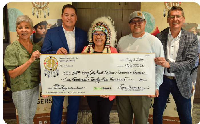
(SIGA was a proud sponsor of the 2024 Tony Cote First Nations Summer Games.)