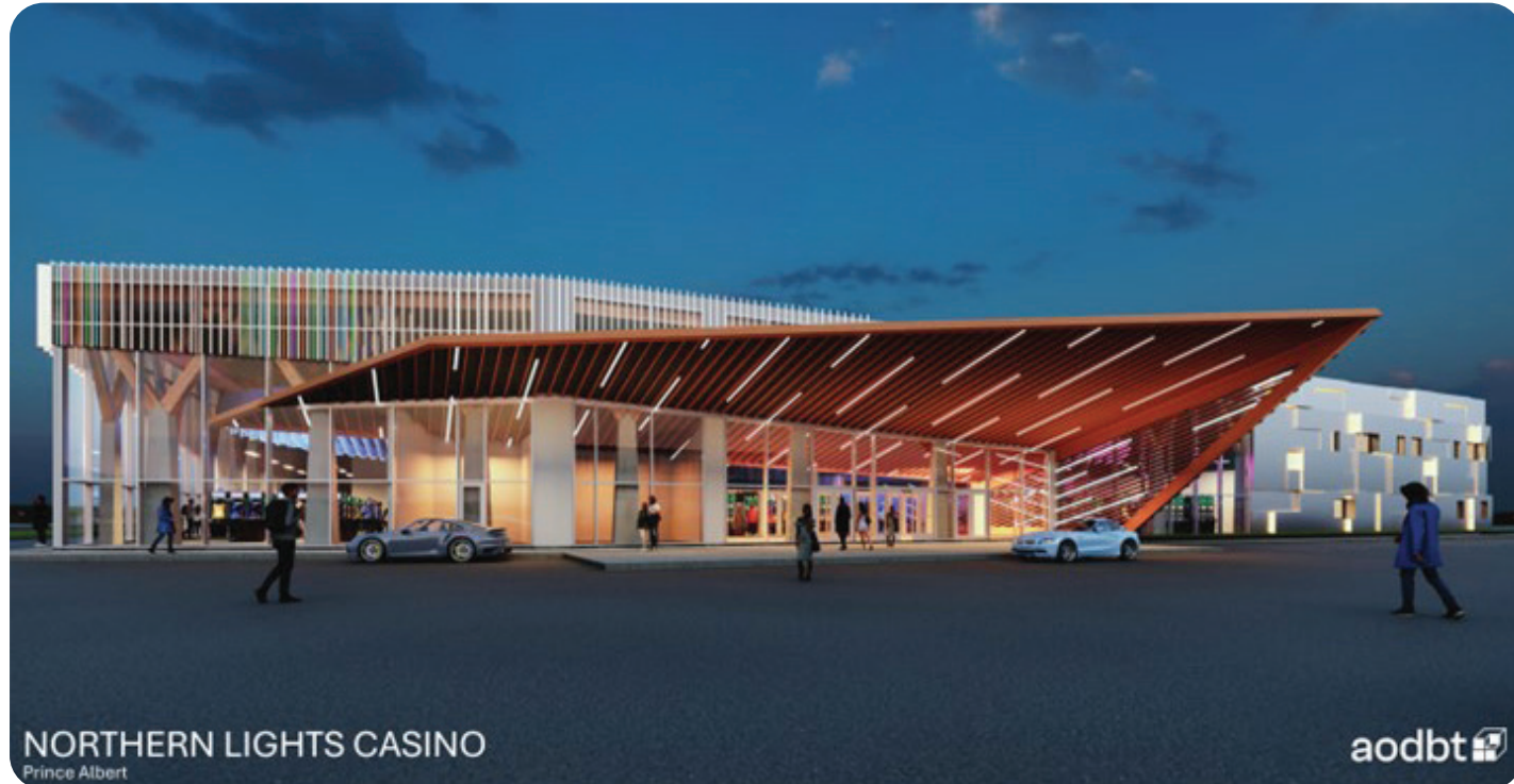
NORTHERN LIGHTS CASINO Prince Albert (An expansion to Northern Lights Casino in Prince Albert was announced in August, which will add 31,000 square feet to the existing property.)

SIGA unveiled plans on August 28, 2024, for a multimillion-dollar expansion project of Northern Lights Casino in Prince Albert, increasing the current gaming floor square footage and making major changes to the interior and exterior of the casino.