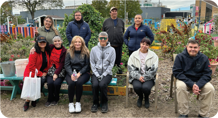
[Volunteers from Dakota Dunes Casino at Saskatoon Food Bank.]