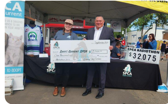
(Living Sky Casino contributes $1000 to the Swift Current SPCA Radiothon.)