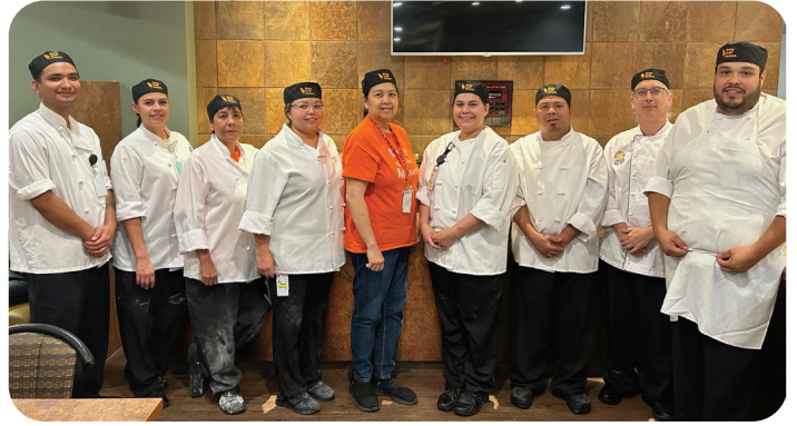
[Northern Lights Casino kitchen staff pose for a photo on Orange Shirt Day.]