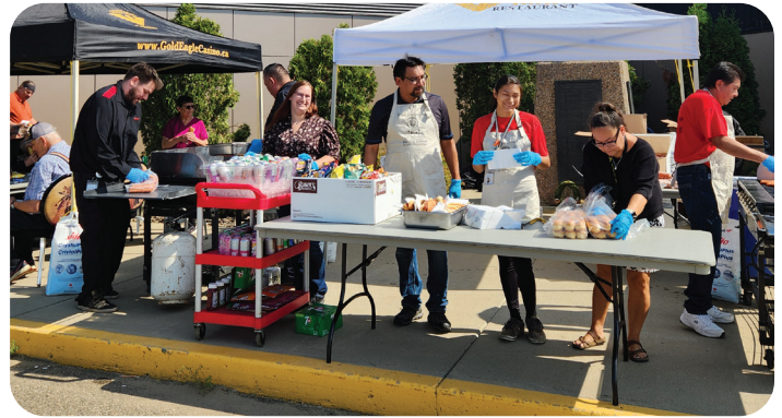
[Volunteers provide the Gold Eagle Casino Community BBQ with good food and company.]