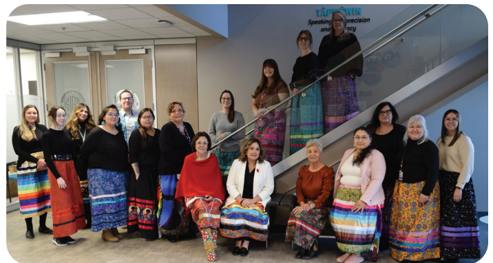
[Central Office staff wear ribbon skirts and shirts for Ribbon Skirt Day 2025.]