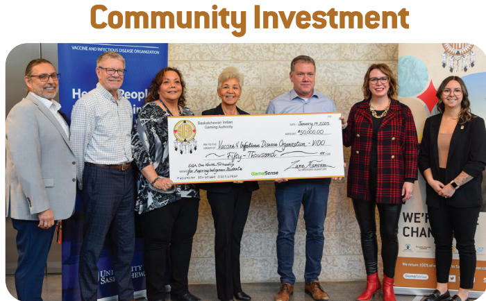
(A $50K contribution from SIGA for the 'VIDO and SIGA One Health Fellowship for Aspiring Indigenous Students.')