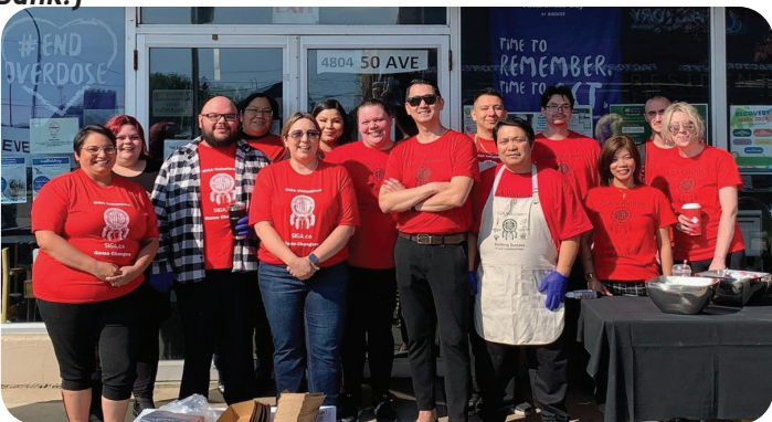
[Gold Horse Casino volunteers outside of Residents in Recover pose for a photo.]