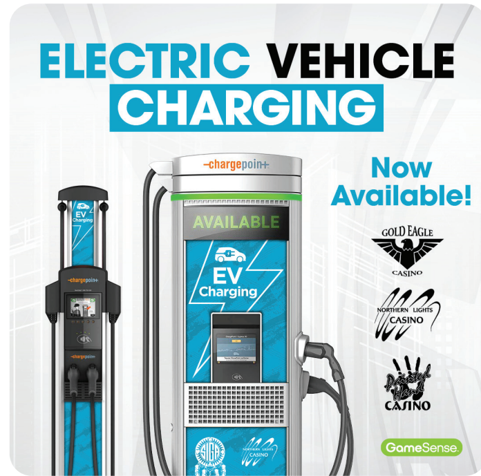
(Above: what the EV chargers will look like once installed.)

Phase 2 will see EV chargers installed at the remainder of SIGA’s seven casinos over the course of the next 12 months.