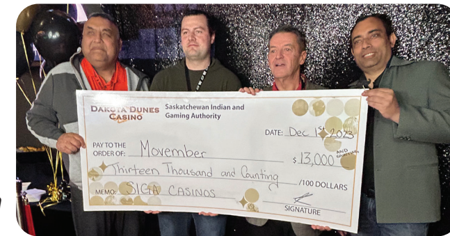
(Right: A cheque for $13K after the Shave Off event.)