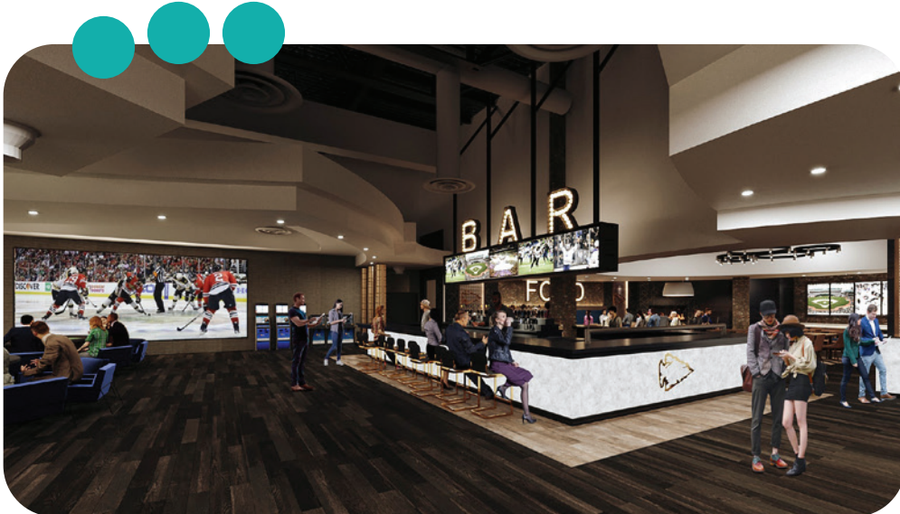
[Pictured Above: Proposed Sports Lounge at DDC rendering.]