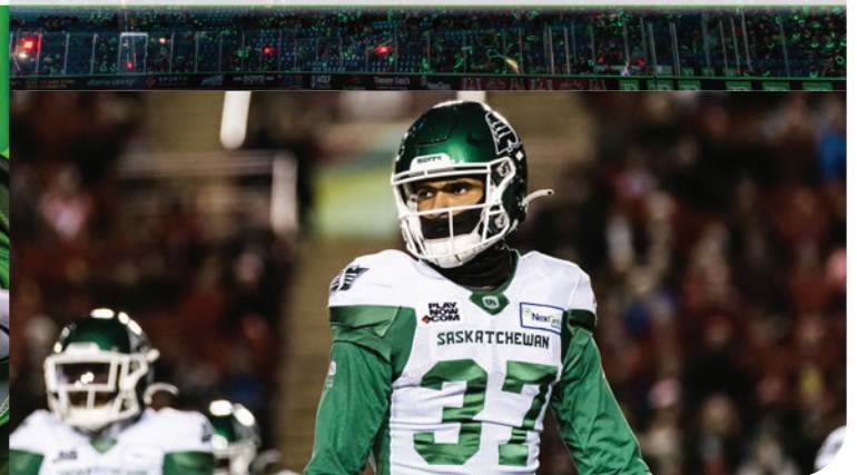
[Pictured Above: PlayNow.com logo featured on Saskatchewan Rush helmet and Saskatchewan Roughrider jersey.]